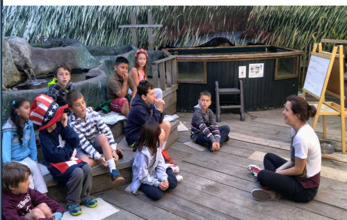
ABOVE: 2016 Ocean Explorers 3rd grade class learning in our first-generation Sea Pocket Aquarium. BELOW: 2023 opening weekend of the Maritime Science Education Center

First and foremost, we are an educational organization, providing opportunities to learn about our history and environment. Over the past 25 years, this mission has inspired countless students and visitors, helping us build a foundation for people to engage and children to learn. Since 2004, Ocean Explorers has educated over 13,000 students, a singular achievement for this type of program.