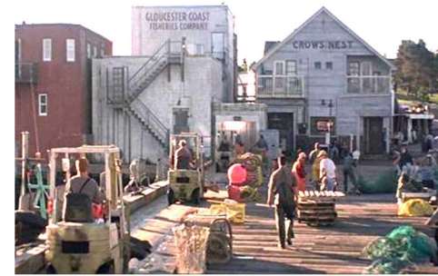
Scene from the 1999 film The Perfect Storm , on what is now Maritime Gloucester’s pier.

Many come seeking a connection to America’s oldest seaport and our legendary fishing community, perhaps with images from The Perfect Storm movie in mind. That movie, filmed on what became the Maritime Gloucester campus, offers a glimpse of Gloucester’s spirit and resilience. Visitors may come here with a Hollywood image in mind, but they soon find out what locals know: we are so much more.